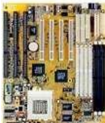
fig: Mother board