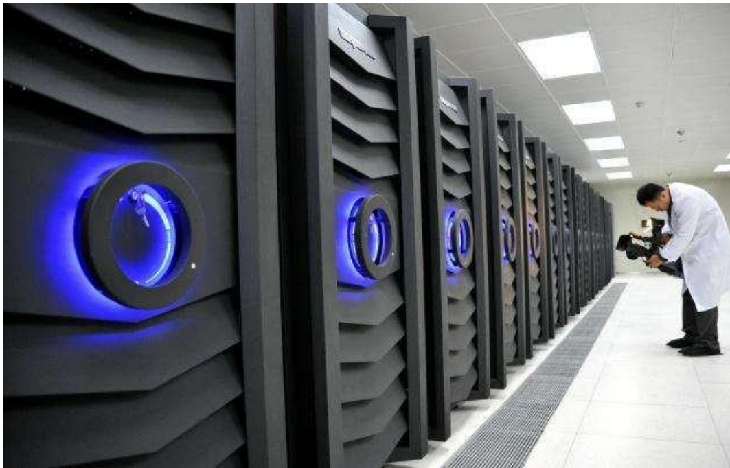
Fig: Super computer