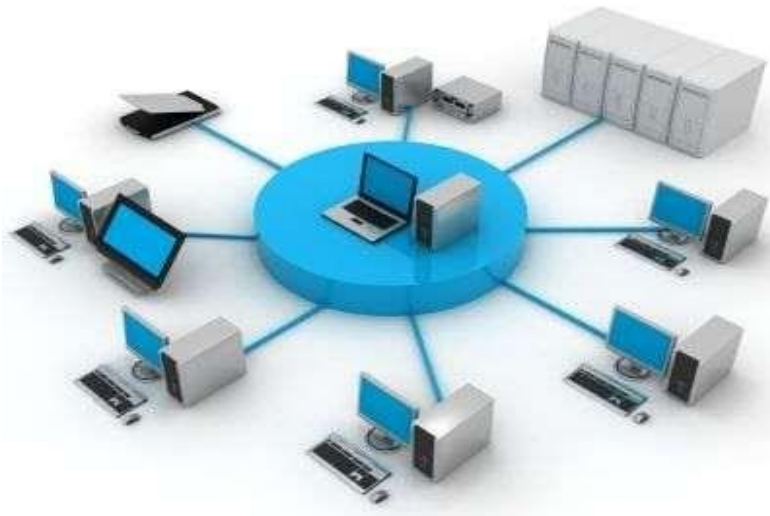
Fig: Network computer.