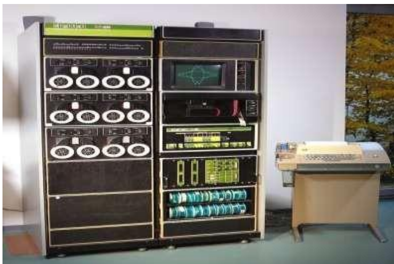
Fig: scientifically calculator minicomputer _1970

Is a class of smaller computers that evolved in the mid-1960s and sold for much less than mainframe and mid-size computers from IBM and its direct competitors? In a 1970 survey,