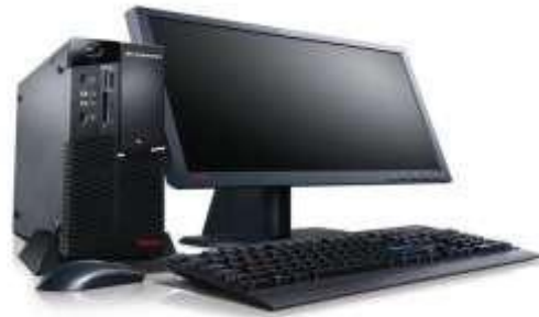
Fig: PC Computer.