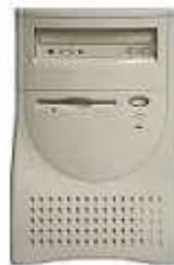
fig: system units